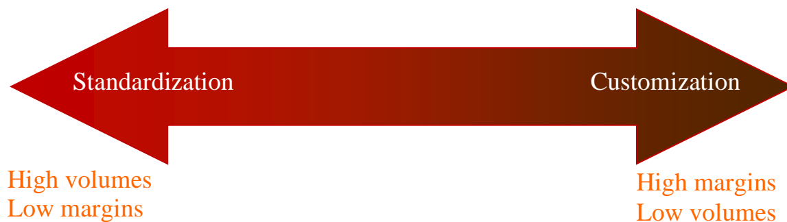
Figure 3: Linking Margins, Volumes and Customization

Capacity can also be expanded by augmenting one's facilities and equipment. Again, leveraging comes into play, where the entrepreneur seeks to share the facilities or equipment of others. Using another company's machines during down time, sharing space in someone's warehouse, borrowing a truck after hours, or outsourcing parts of the work can enable the entrepreneur produce more without making big investments.